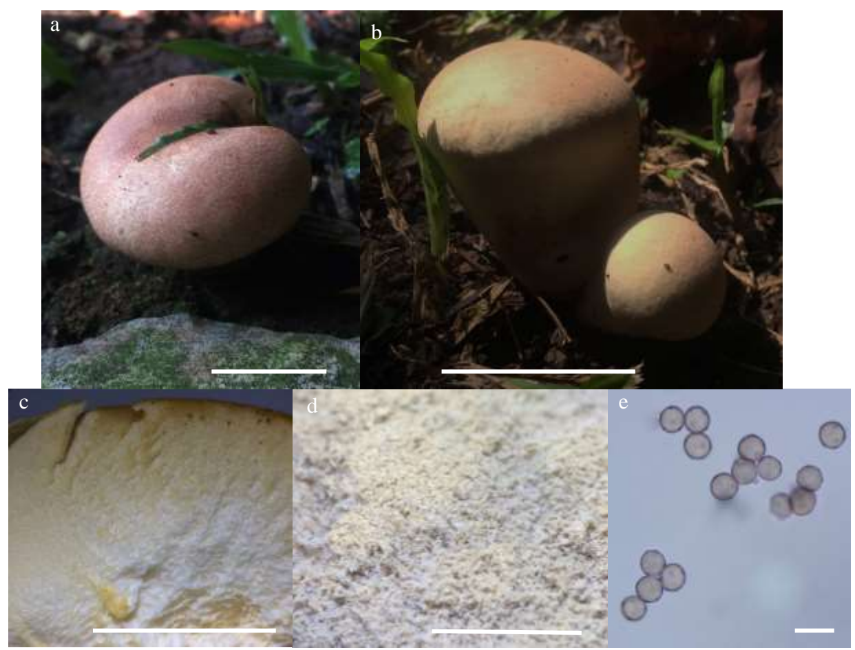
Fig. 1 Calvatia rugosa . (a) Fruiting body; (b)Gregariously fruiting bodies (1) immature and (2) mature; (c) Slicing of immature fruiting body; (d) Slicing of mature fruiting body; (e) basidiospores. Scale bars: (a; b) 5 cm; (c) 5 cm; (d) 3 cm; and (e) 5 μm.

grassy field. The surface of this fruiting body was smooth and free of ornament. The texture was spongy, squeeze, and soft. The immature fruiting body showed that the gastrothecium was white in middle and yellowish in the out part (Fig 1c). This observation showed that the maturing process was begun from the out part. The yellowish part firstly showed at the edge position. Then, the mature fruiting body will contain many yellowish to yellow-brown part which contains mature basidiospores. The gasterothecium contains numerous basidiospores looked like brownish dust without the whitish part compared with immature fruiting body. The fruiting bodies were collected at the immature and mature stages. The immature fruiting body showed like puffball with pseudostem.