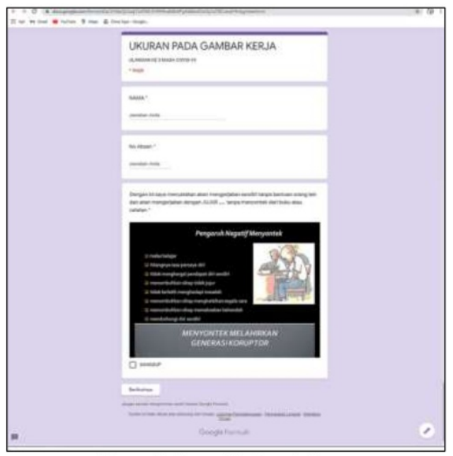
Figure 2. Test with Google form