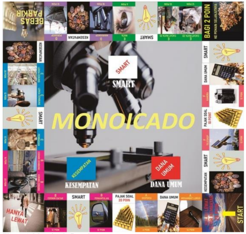
Figure 1. Monoicado Board

The media equipment for the game monopoly on Light and Optical Instruments is as follows: