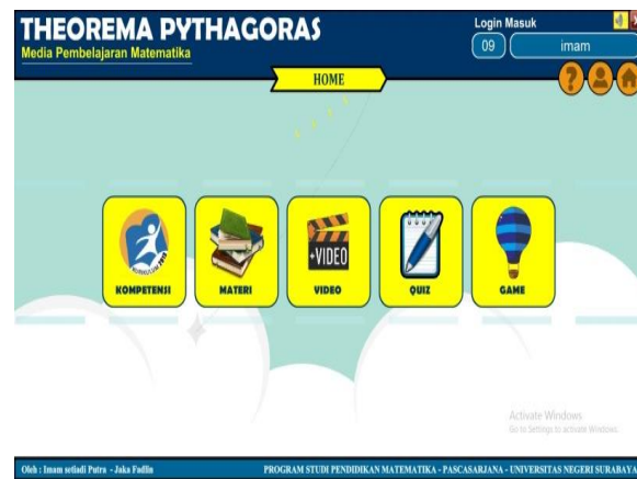
Figure 1. Display of ICT Media