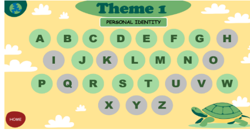
Making cover for the dictionary