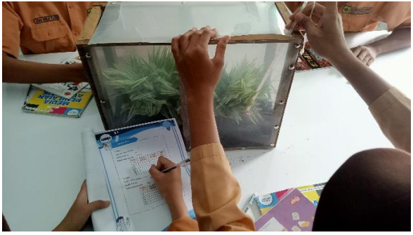
Figure 2. Implementation of Phase 3, guiding investigation participants to educate

In the first phase of the PBL model, namely problem orientation, there are activities inviting students to observe the phenomenon by asking questions. In the second phase, namely organizing students by describing the problem by seeking information from all sources. In the third phase, namely guiding student investigations by giving students trigger questions related to solutions to climate change, then students carry out experiments. In the fourth phase, namely developing and presenting results by encouraging students to analyze the data obtained correctly, the teacher encourages students to create their version of green space ideas as a solution to the problem of climate change, this phase takes a long time. In the fifth phase, namely analyzing and evaluating the problem-solving process by reviewing learning materials and providing opportunities for question and answer. Can stated that learning can be accomplished with effectiveness. Activity action climate in research held phase 3 are participant educate carry out experiment room green for get knowledge in solution problem from problem change climate.