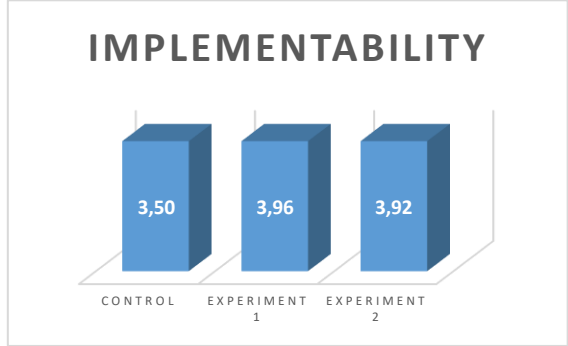
Figure 1. Results Data of Implementation

Teacher activities during learning were observed and assessed by 3 observers, namely 2 physics teachers MA Matholi'ul Anwar, and 1 State University of Surabaya Physics Education undergraduate student. The observer observes and assesses teacher activities to know the suitability of teacher activities with stages of the PBL model. As for the results of data evaluation implementation Teacher activities are presented in Figure 1.