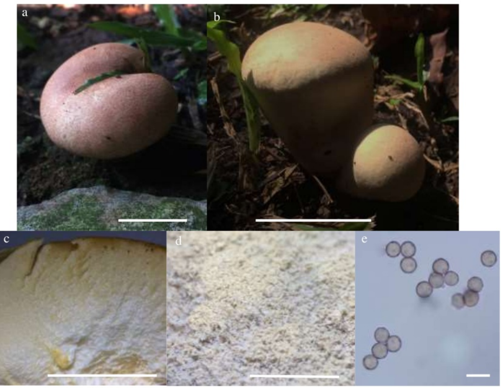
Fig. 1 Calvatia rugosa . (a) Fruiting body; (b) Gregariously fruiting bodies (1) immature and (2) mature; (c) Sliong of immature fruiting body; (d) Slicing of mature fruiting body; (e) basidiospores. Scale bars: (a; b) 5 cm; (c) 5 cm; (d) 3 cm; and (e) 5 \mu m.

grassy field. The surface of this fruiting body was smooth and free of ornament. The texture was spongy, squeeze, and soft. The immature fruiting body showed that the gastrothecium was white in middle and yellowish in the out part (Fig 1c). This observation showed that the maturing process was begun from the out part. The yellowish part firstly showed at the edge position. Then, the mature fruiting body will contain many yellowish to yellow-brown part which contains mature basidiospores. The gasterothecium contains numerous basidiospores looked like brownish dust without the whitish part compared with immature fruiting body. The fruiting bodies were collected at the immature and mature stages. The immature fruiting body showed the puffball without stem. Then, the mature fruiting body showed like puffball with pseudostem.