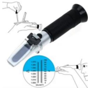
Figure 1. Research design using a refractometer. (Udos et al., 2020)

illustrated in Figure 1 . The last results of our experiment obtained graphic representation linear regression of different type mango fruits.