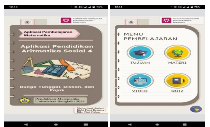
Figure 2. Initial Interface of the MathArt Application and Second Page Interface of the MathArt Application

cannot learn, unlearn, and relearn' (Toffler, 1980), underscores the commitment to harnessing modern technology for educational advancement. These platforms enable the creation of dynamic and interactive learning materials tailored to students' needs, with Microsoft PowerPoint utilized for storyboarding and CapCut for refining video content, ensuring clarity and coherence in educational material presentation.