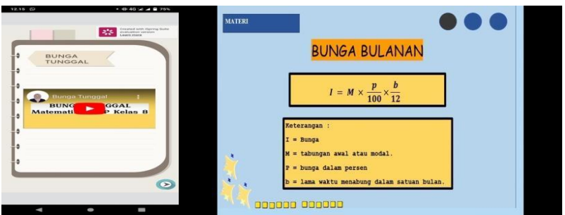
Figure 7. Display of Material I Video Page

In Figure 6, depicts the initial view of the single interest material page, explaining single interest. Subsequently, on the second and third pages, the formula for single interest is displayed alongside explanations of the formula's symbols. Hence, students can better grasp the material and understand the simple interest formula presented in the MathArt application.