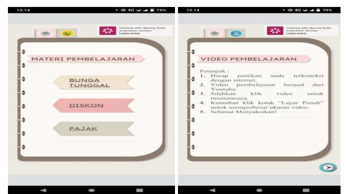
Figure 4. Interface Display of the Objectives and Instructional Videos Features in the MathArt Application

deeper engagement and comprehension. This approach, coupled with Benjamin Franklin's adage, "Tell me and I forget, teach me and I may remember, involve me and I learn," emphasizes the importance of actively involving students in their educational endeavors (Franklin, 2014). Thus, through a clear articulation of objectives, the MathArt application cultivates enriched learning experiences, driving students towards academic excellence.