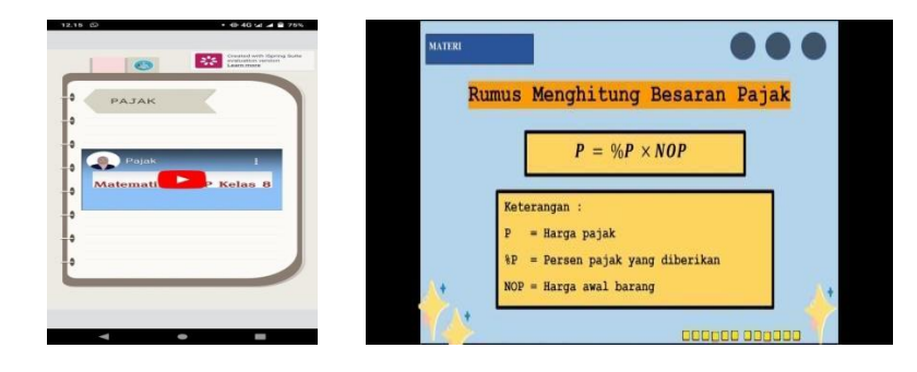
Figure 10 illustrates the page layout for the tax material. On the initial page of the material, the definition of tax is provided, employing easily understandable language for students. Subsequently, the second and third pages display the tax formulas accompanied by explanations of the formula symbols. Thus, students can better comprehend the material and understand the tax formulas presented in the MathArt application.