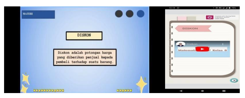
Figure 9. Image Display of the Video Page for Material II

formula for discount is presented along with explanations of the formula's symbols. This enables students to better comprehend the material and understand the discount formula presented in the MathArt application.