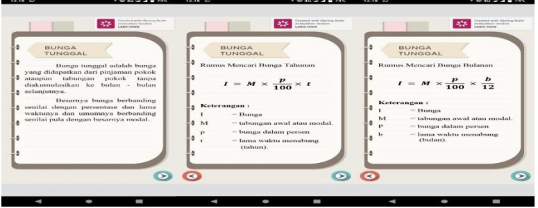
Figure 6. Display Image of Material I

at the end. Below is a further explanation of the material indicator in the MathArt application: