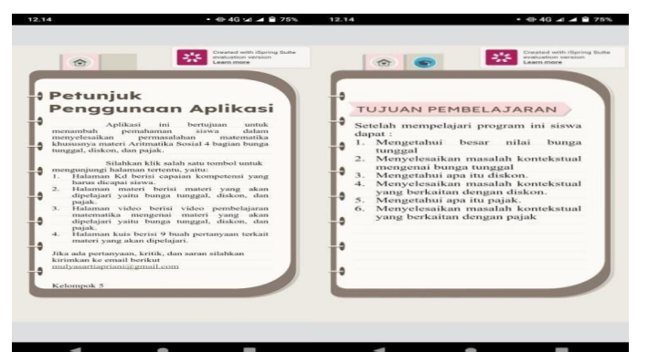
Figure 3. Second Page Interface of the MathArt Application and Interface of the Objectives Feature in the MathArt Application

Figure 2 illustrates the initial interface of the MathArt application. The initial interface features the developer's logo, the title of the application's content, and the name of the learning module. On the right side of figure 2 depicts the second page of the MathArt application. On this page, users can find the menu options available in the MathArt application. These options include instructional guidelines, learning objectives, learning materials, instructional videos, and quizzes designed to enhance students' skills.